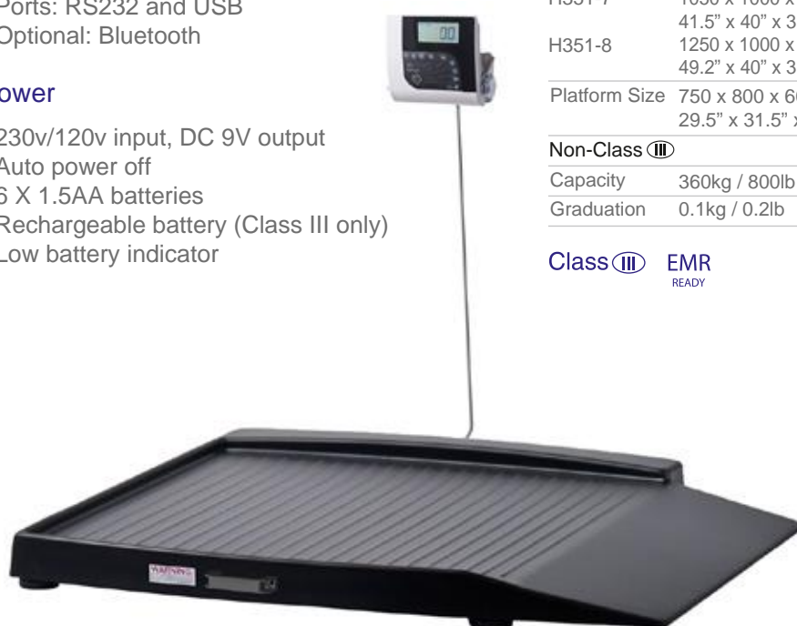
H351-7 with one wide ramp