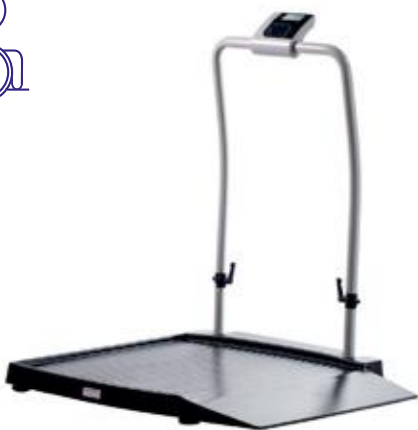
H351-2 with one wide ramp