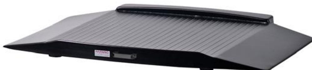
H351-8 with two wide ramps