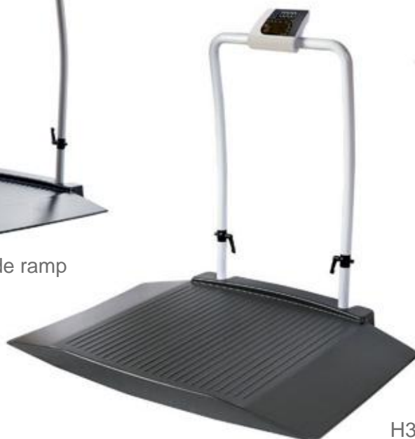
H351-3 with two wide ramps